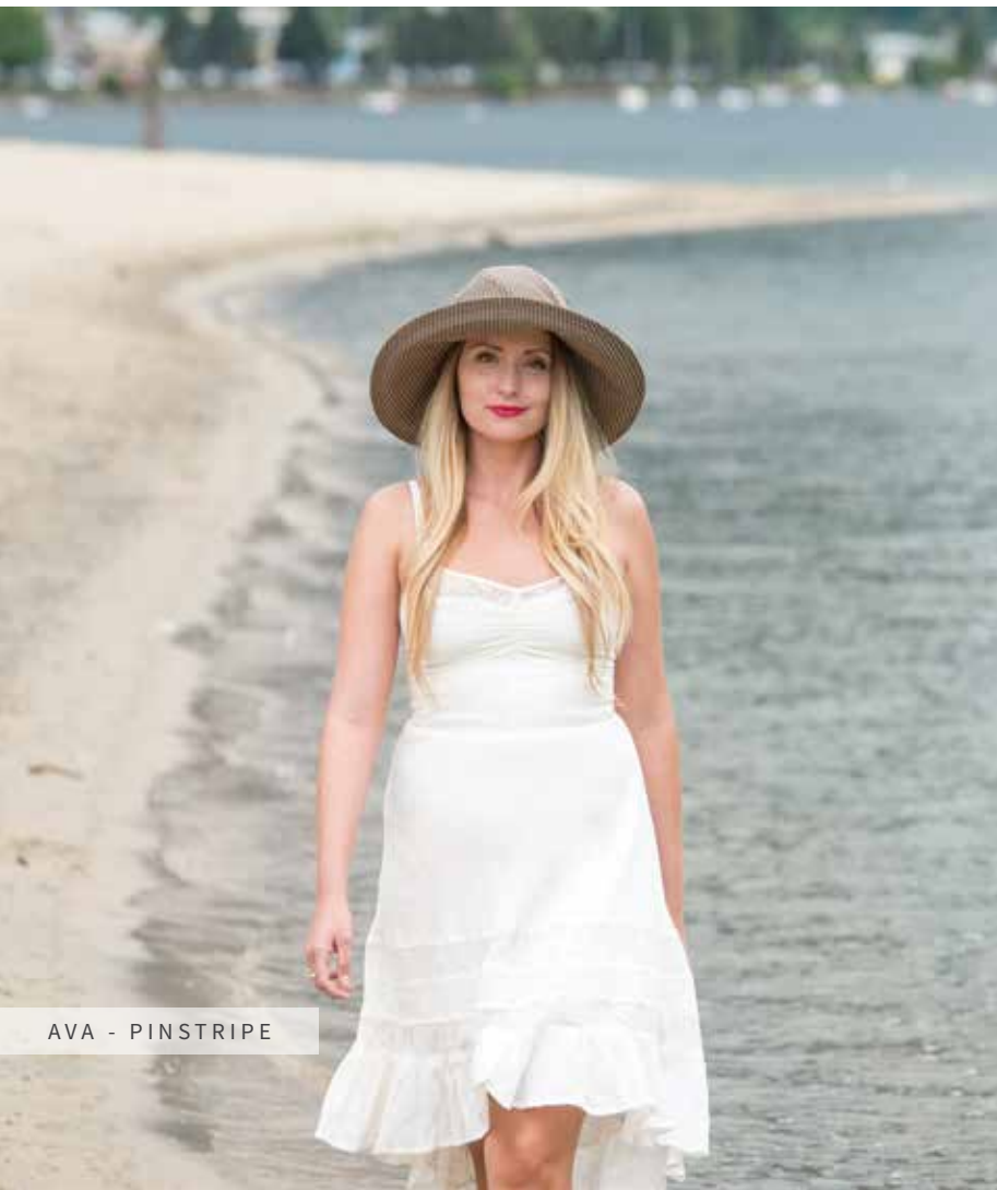
AVA - PINSTRIPE