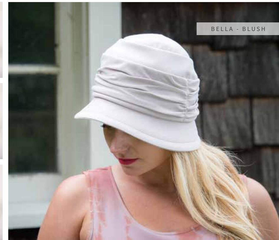
BELLA - BLUSH