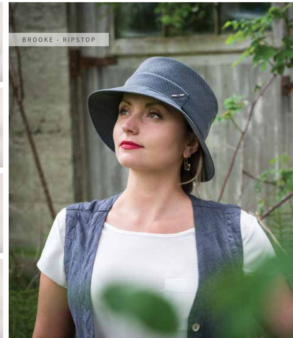
BROOKE - RIPSTOP