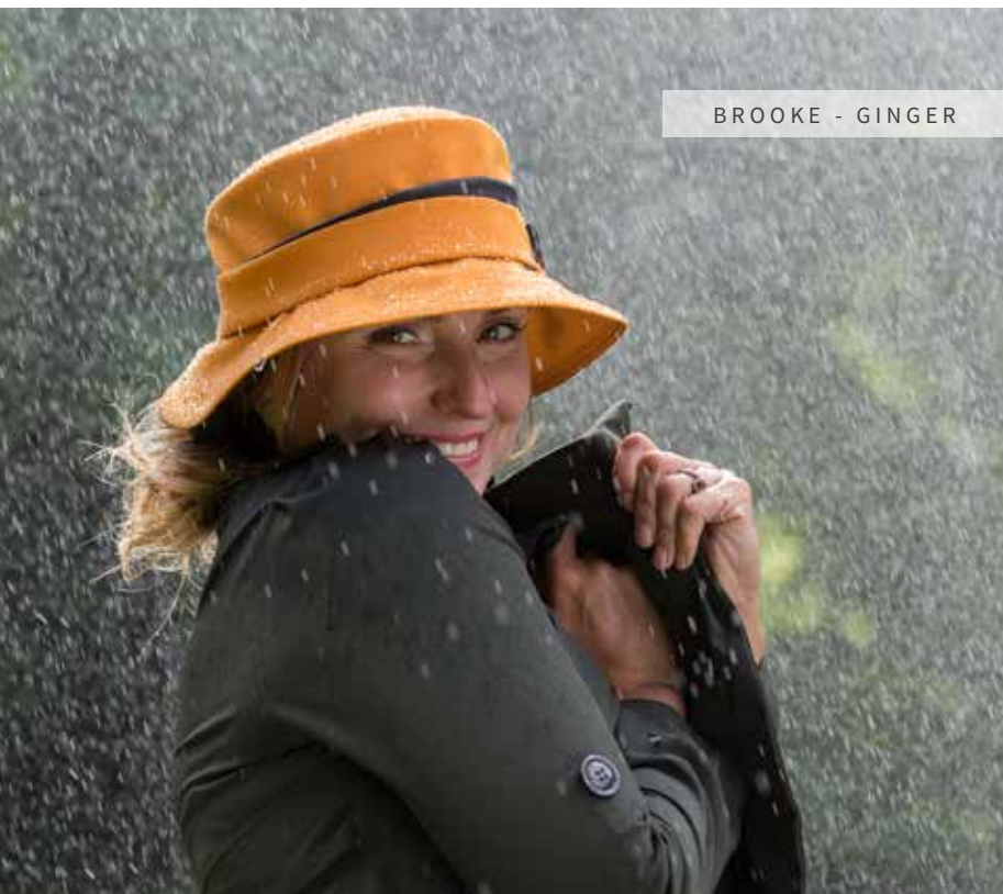
BROOKE - GINGER