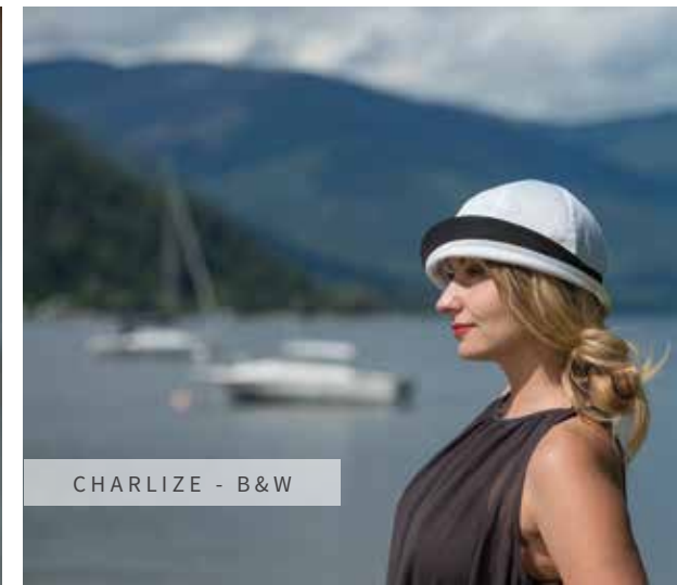
CHARLIZE - B&W