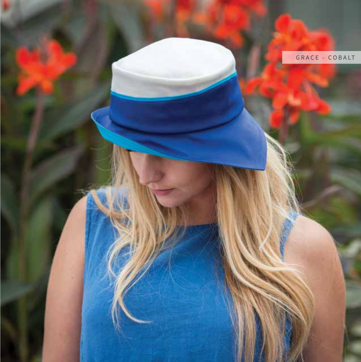
GRACE - COBALT