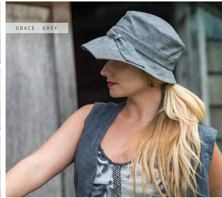
GRACE - GREY