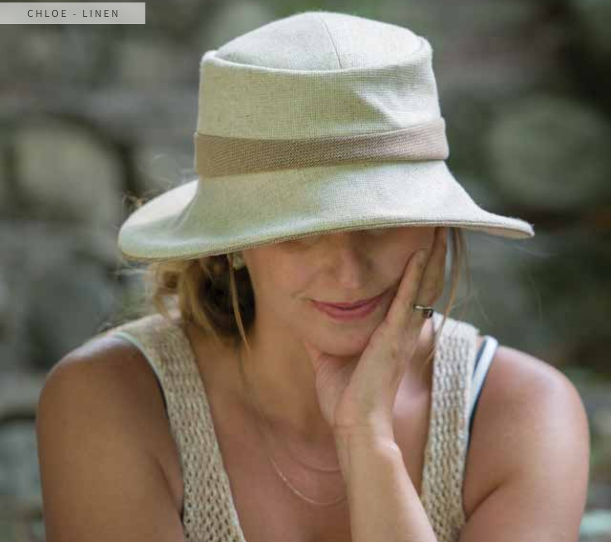
CHLOE - LINEN